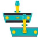
Frame with velcro system with Block System